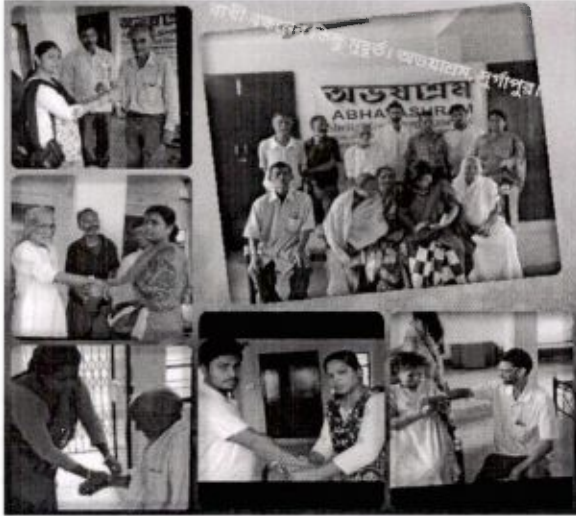
Raskha Bandhan 2017

Purbachal Ananda Foundation also took initiative and celebrated 'Raksha Bandhan' and 'Independence Day' with the inmates of the 'Abhayashram'. People from various walks of life had been invited to come together and rejuvenate the occasion.