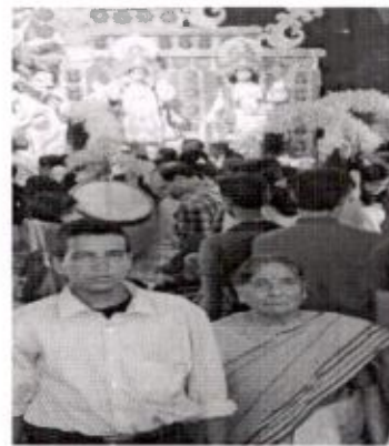
Durgapujo Parikroma 2017