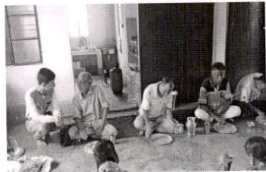
Having Lunch together