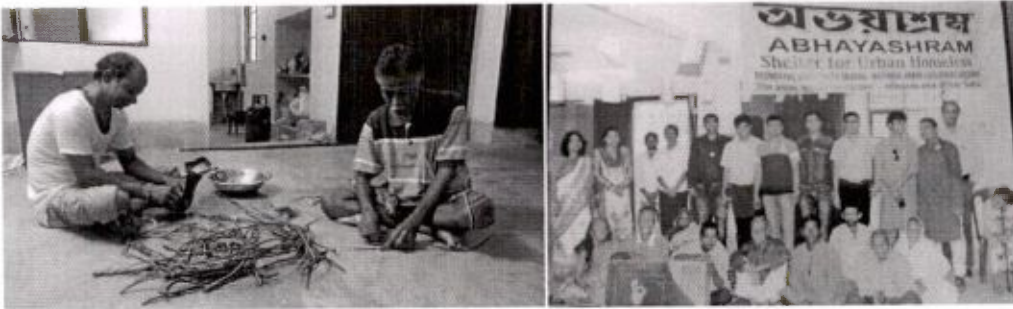
In different mood