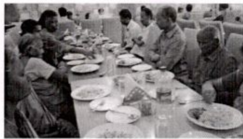
Having food in a Restaurant