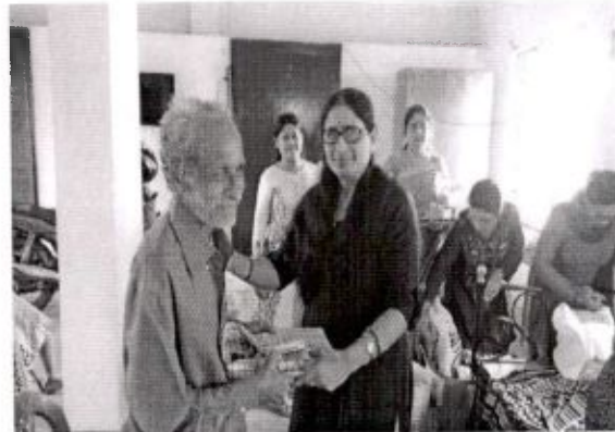
Watching Television (The TV had been donated by some organisation)

Inmates preparing paper pouches for generating income