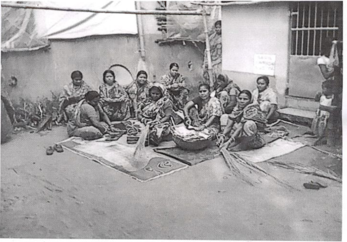
ওয়ার্ড নং- ১২ ভূঞাপাড়া গোষ্ঠী (SHG)